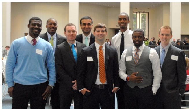
Brothers at the Annual Honors Luncheon