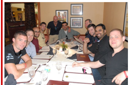
Brothers get together Family Dinner at GCC