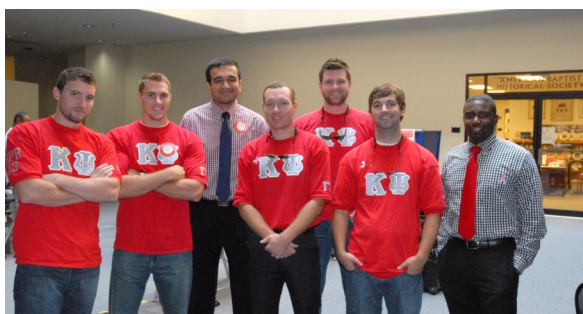
Gamma Psi Brothers at Red Cross Blood Drive