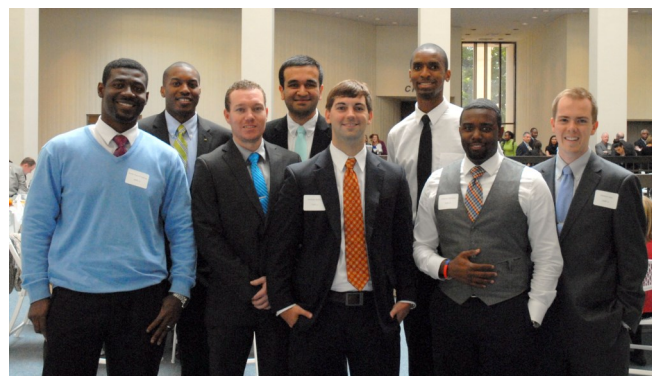
Brothers at the Annual Honors Luncheon