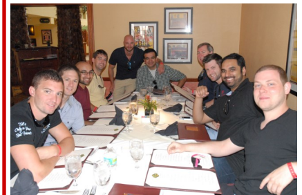
Brothers get together Family Dinner at GCC