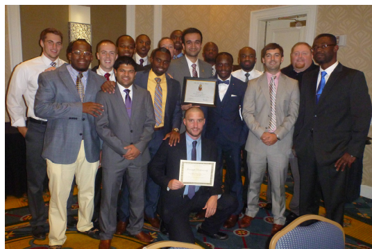
Gamma Psi Brothers at Atlantic Province's Summer Conclave