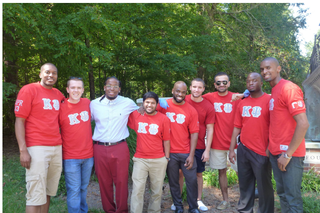
Brothers at Road Side Cleanup