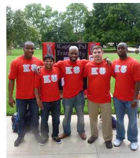
Newly initiated Brothers at COS Picnic