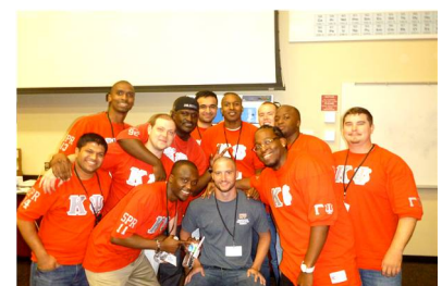
Locks of Love Philanthropy at Atlantic Province's Summer Conclave