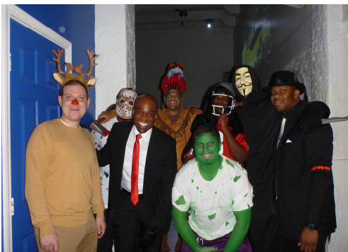
Gamma Psi Brothers at our Annual Halloween Social