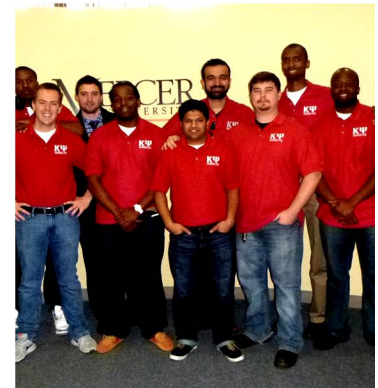
Teaming up with Red Cross for a successful blood drive