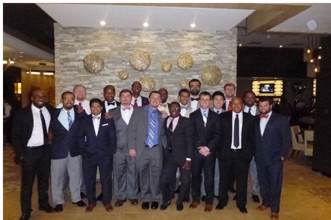
Brothers at the 57th Grand Council Convention