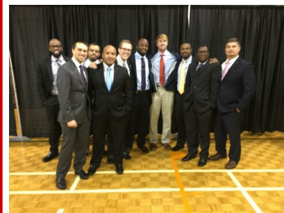
Brothers receiving scholarships at this year's Honor's Luncheon at Mercer University