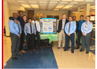
Brothers providing information on men's health awareness during No Shave November