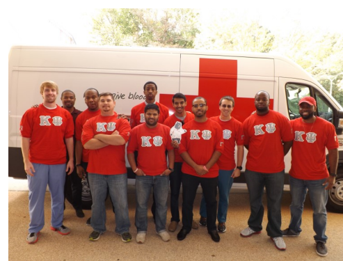
Brothers participating in the Red Cross Blood Drive