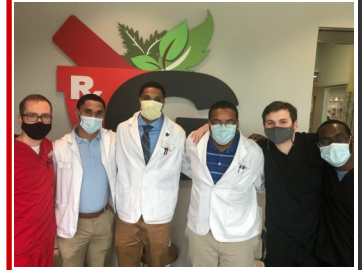
Narcan Education Event