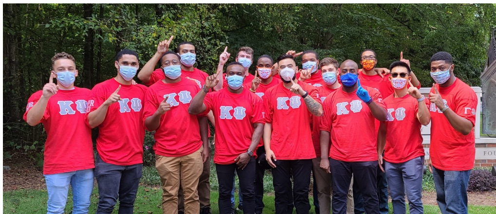
Brothers at the first Roadside Cleanup of the semester