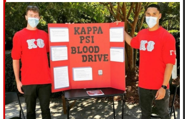
Blood Drive Tabling Event