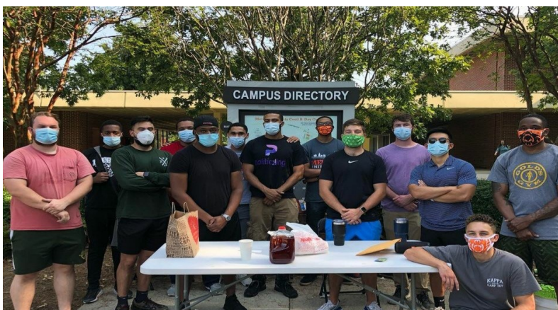
The First Kappa Psi Car Wash of the Semester