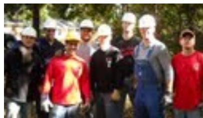
Building houses and looking good at the same time

"When unto the end we've come, And behold the setting sun, our thoughts shall be high, of Kappa Psi".