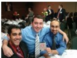
Brothers enjoying winter conclave