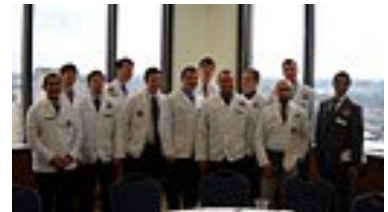
Brothers out in force for GPHA's VIP day at the Capitol

on both the part of the individual and on the part of the brotherhood each to one another. Without the individuals putting forth their own hands we can never achieve the hundred hands extended to lift each other up. It has also been said that you get out of the fraternity what you put in. If you quit giving your time, money, and talent to the fraternity after