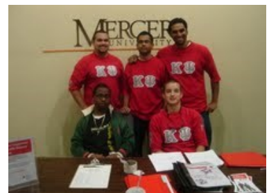
Gamma Psi's Red Cross Blood Drive at Mercer