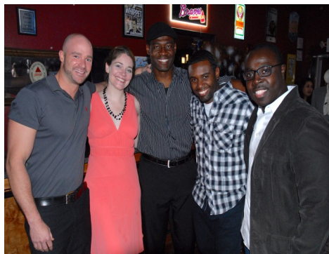
Gamma Psi Brothers at the Pledge Party