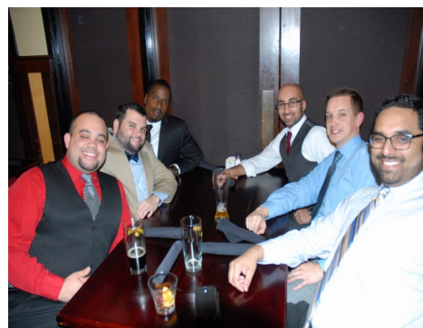
Alumni Brothers at Founder's Day