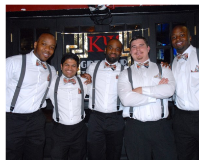
Pledges gathered together during the Pledge Party