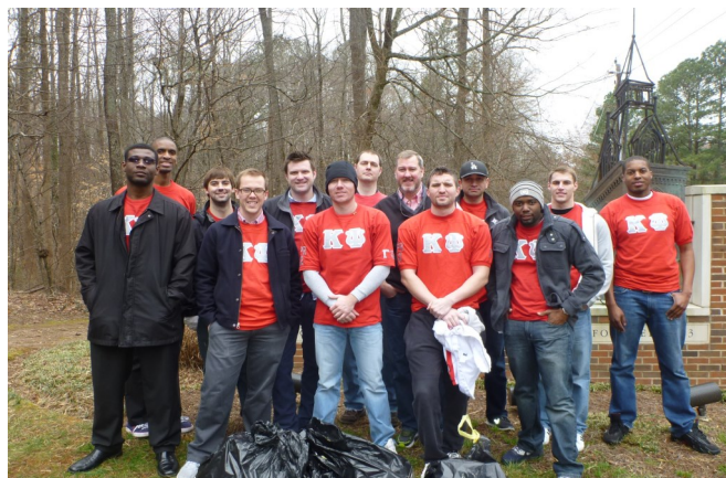
Brothers at the Roadside Cleanup.