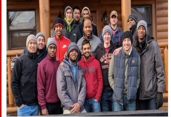
Gamma Psi Annual Ski Trip