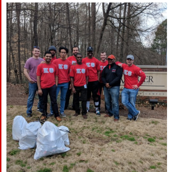
Gamma Psi Roadside Clean-up