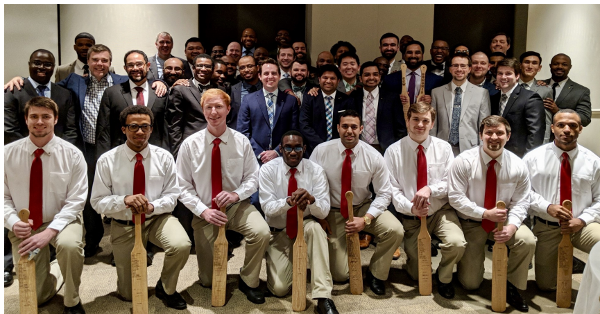
Founder's Day Dinner 2018