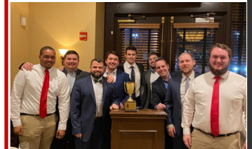
Inaugural Family Tree Games Champions