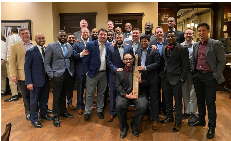
Alumni Brothers paying homage at the Founder's Day Banquet