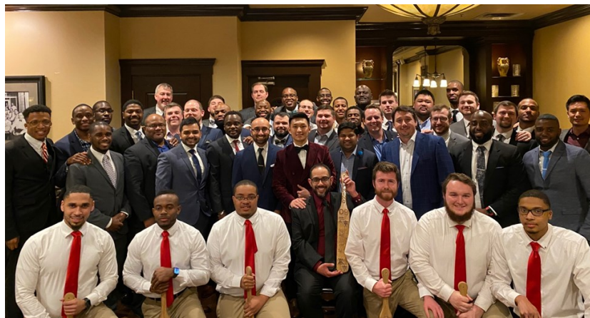
Brothers gathered for the 2020 Founder's Day Banquet