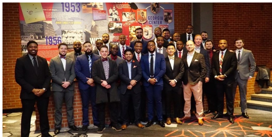
Brothers at the Atlantic Province Winter Assembly - Athens, GA